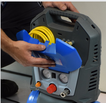
Smart flap for your tools storage. Be always ready.