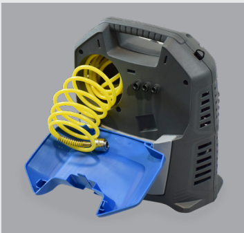
Spiral hose with universal tools mount.