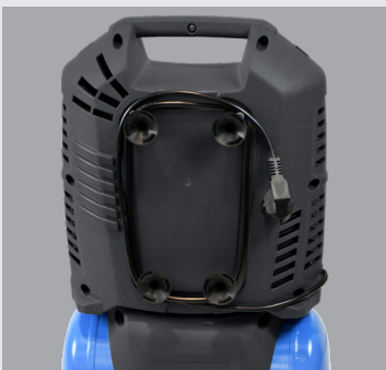
Extra shock absorber feet for horizontal use.

Ease of use and compactness are the most notable attributes behind new ABAC Suitcase air compressor.