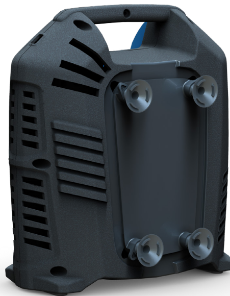
SUITCASE 0 1.5 HP

Extra small sizes are not reflecting the performances of ABAC Suitcase which offers on the contrary important air displacement of 160 l/m, 8 bar pressure and relies on 1,5 HP engine power.