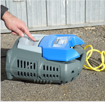
Designed to work efficiently both in vertical and horizontal position.